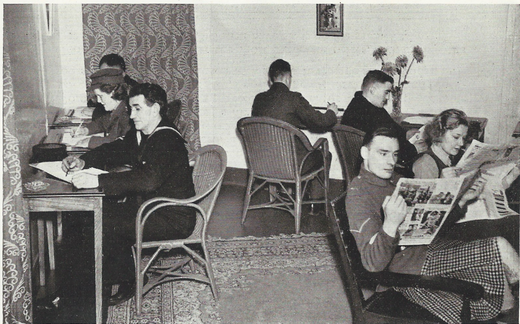
THE WRITING AND SILENCE ROOM