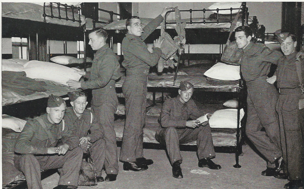
ONE OF THE DORMITORIES