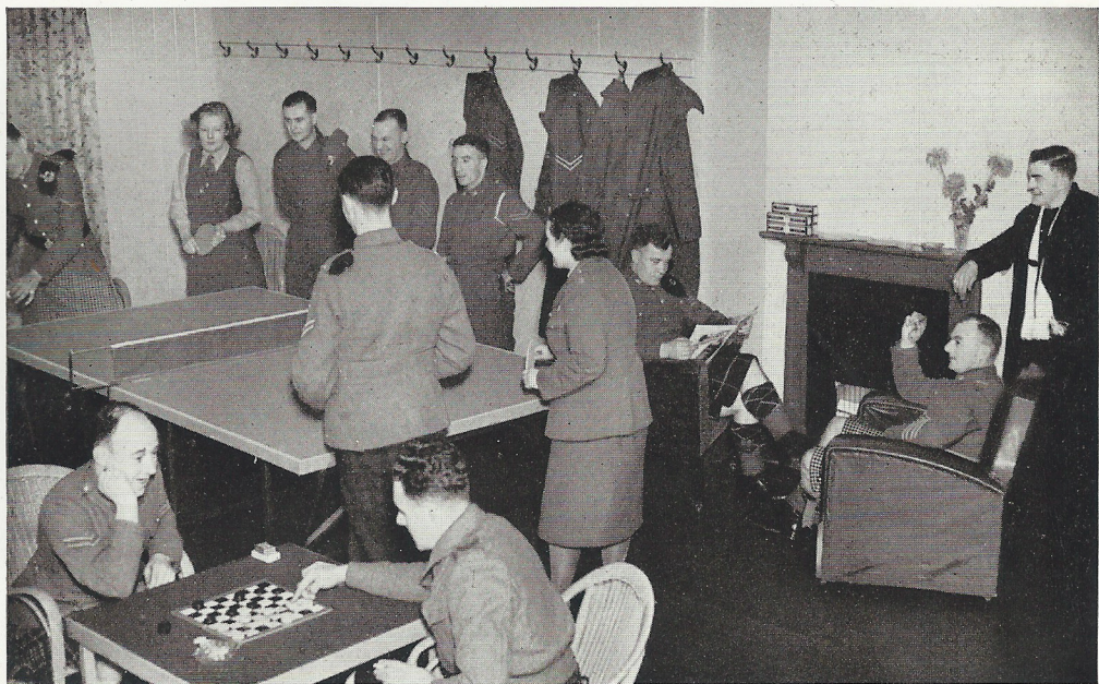
A CORNER OF THE AMUSEMENT HALL