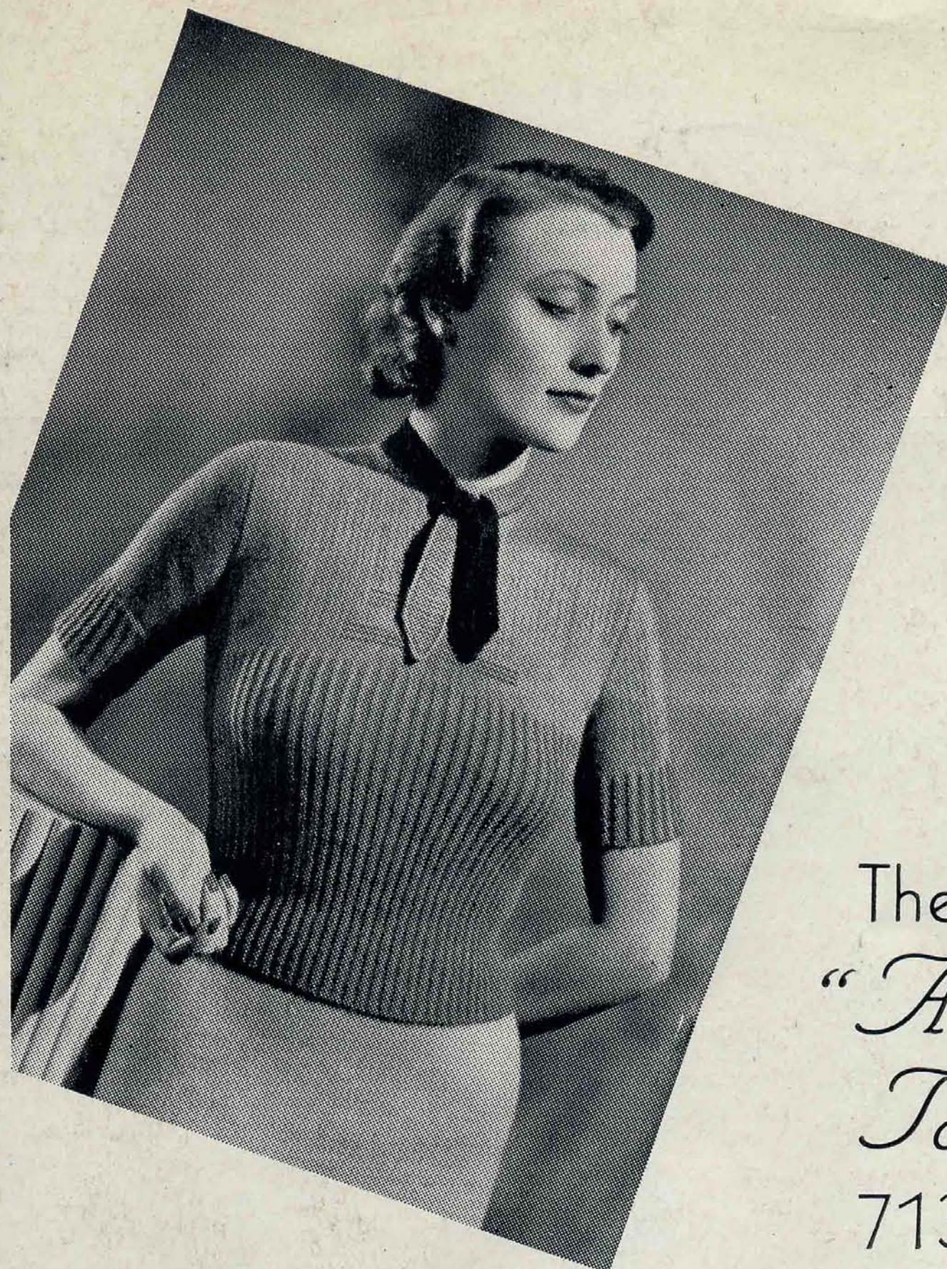
The "About" Town 713

Made with Monarch Andalusian Description on page 17