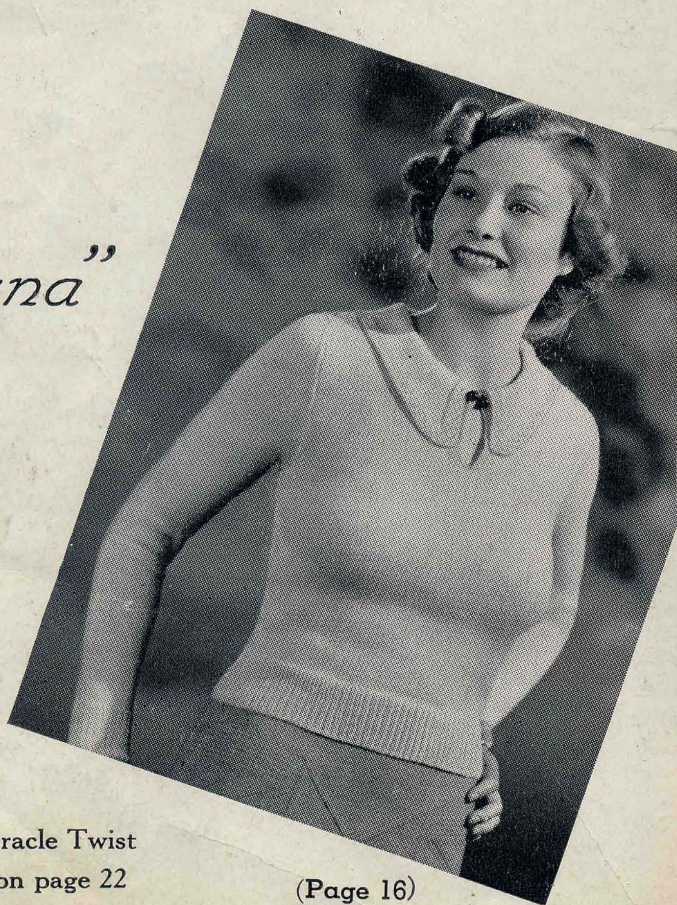
The "Diana" 714

Made with Monarch Miracle Twist Description on page 22