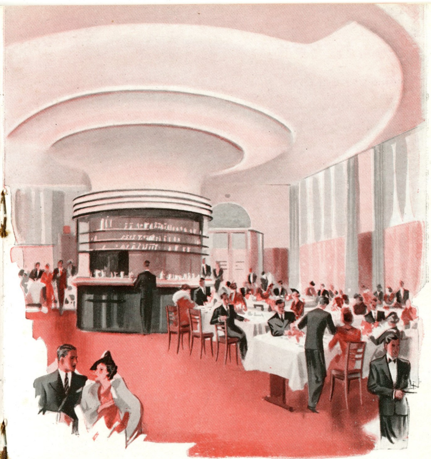
PRUNIER'S , 72, St. James's St., S.W.1. Tel.: REG. 1373. "Everything coming from the sea" is the slogan of Pruniers. Oysters, fish, caviare and all other delicacies—beautiful wines. Lunch and Dinner à la carte or Blackout Dinner 10/6, including oysters, fish or meat course, sweet and cheese.

BOULESTIN , 25 Southampton Street, Covent Garden. Tel.: TEM. 7061. Day and night. A.R.P. shelter in Restaurant.