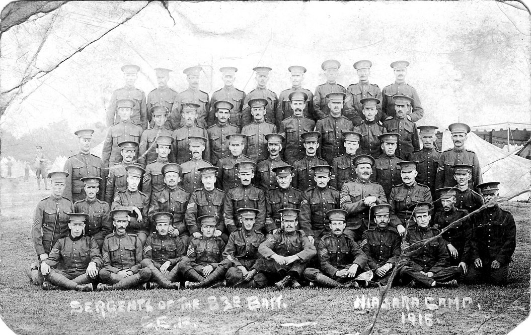
SERGEANTS OF THE 23RD BATT.