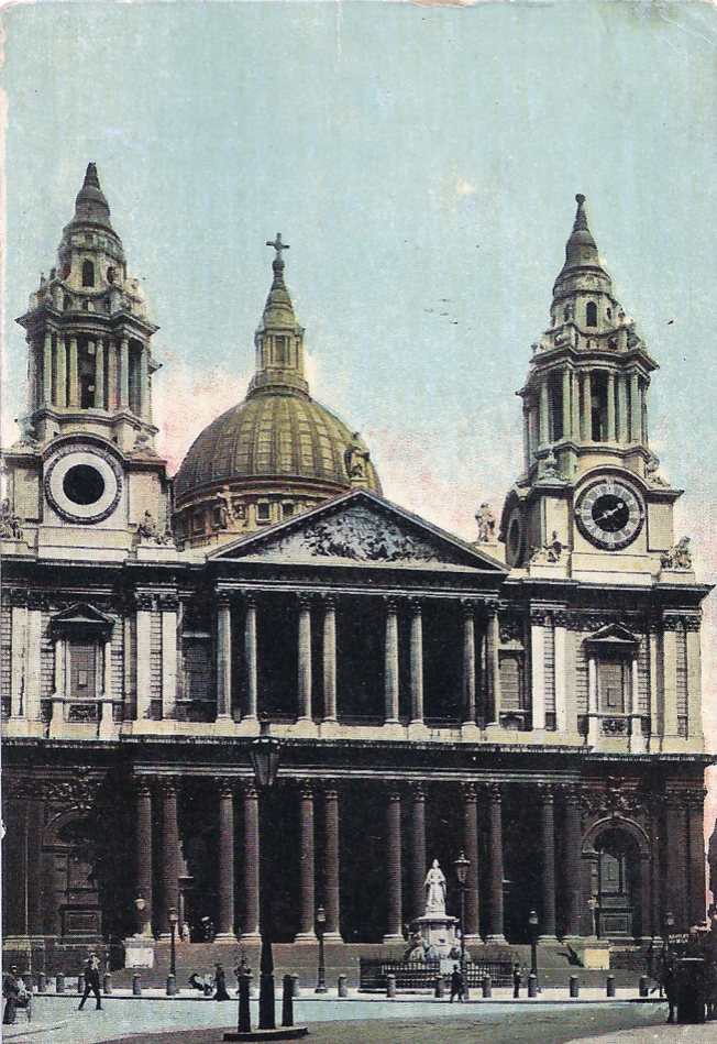
St Paul's Cathedral, London.