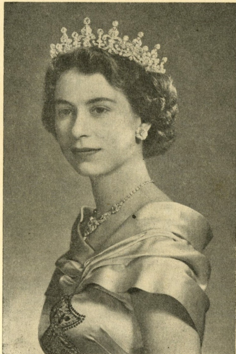
HER MAJESTY, QUEEN ELIZABETH II.

Keep in touch with your Church and say your prayers each day.